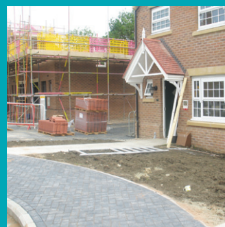
Draft November 2014